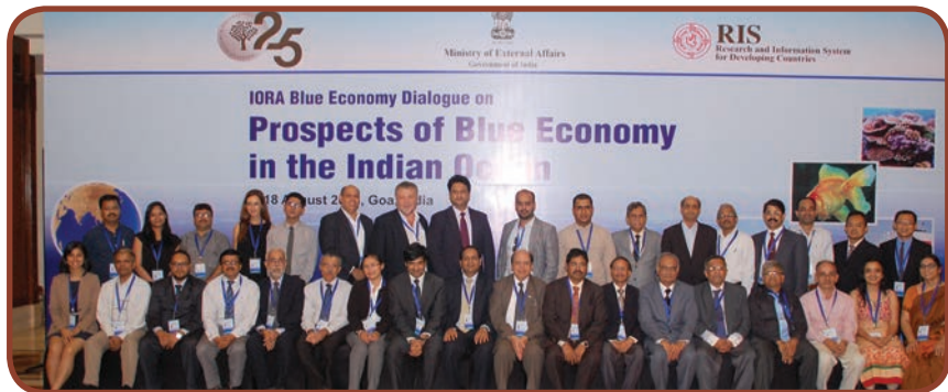
Participants of the IORA Blue Economy Dialogue on Prospects of Blue Economy in the Indian Ocean.

In view of the importance of the subject, RIS took initiative to organise this important conference. Academicians, policymakers, diplomats and informed intelligentsia