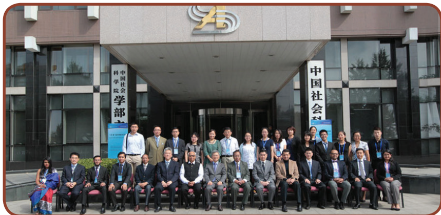
Participants of the One Belt, One Road and BCIMS Regional Interconnection conference.

The Bangladesh-China-India-Myanmar Economic Corridor (BCIM-EC) is complementary to achieving the vision of 'One Belt, One Road'. The BCIM countries fall under the ancient South-western Silk Road connecting Southern part of China, Myanmar, Bangladesh, and India including the northeastern states. After decades of deliberation and discussion as a Track II think tank level initiative, BCIM-EC eventually got official recognition as a Track I inter-governmental initiative in 2013. Considering the immense potential and opportunities for cooperation, this conference