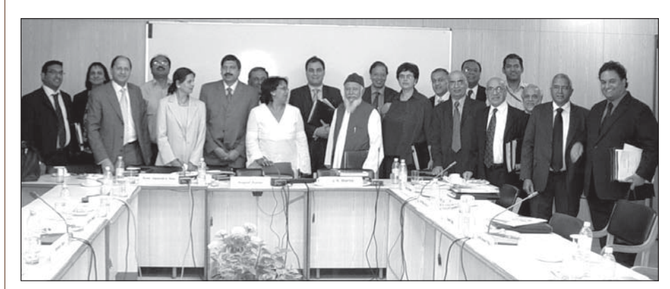
The delegation of the Parliamentarians of Indian Origin from UK, Europe and US at RIS.

A Delegation of Indian Origin Parliamentarians from UK, Europe and the US visited RIS on 25 October 2007 for an interactive session on India's Economic Performance and Prospects.