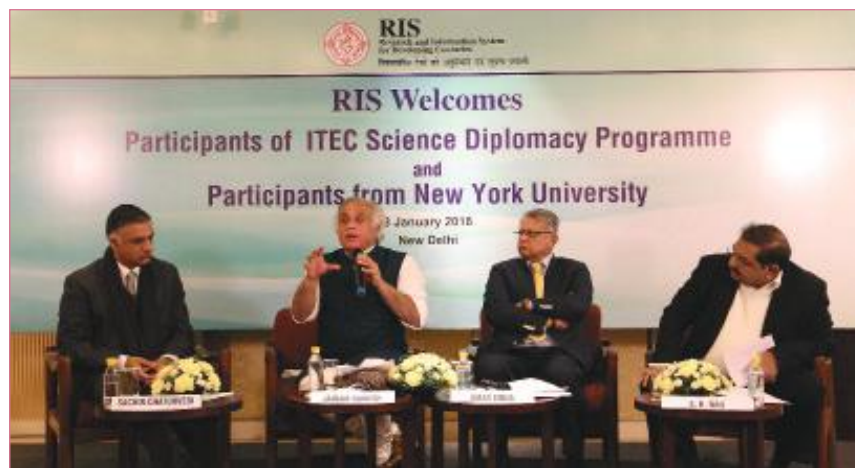
Dr Jairam Ramesh, Hon'ble Member of Parliament, delivering the inaugural address.