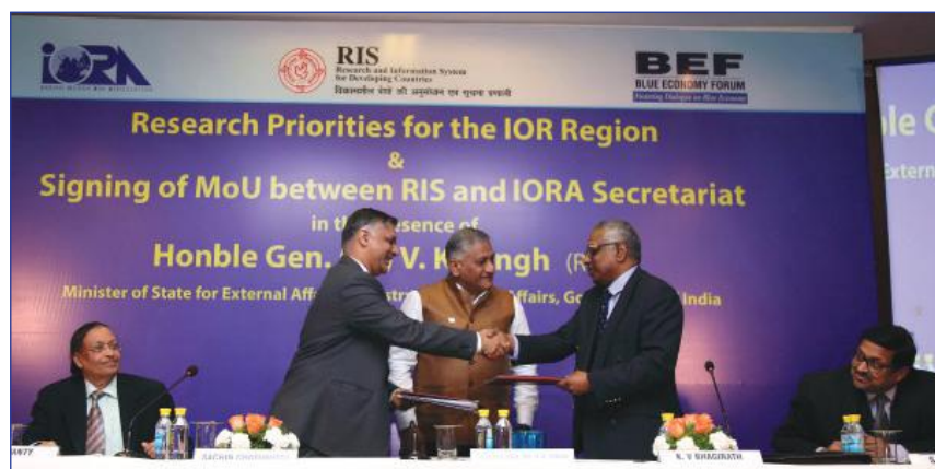
Signing of MoU in the esteemed presence of Hon'ble Minister of State for External Affairs, Gen. (Dr) V.K. Singh (Retd.).

In continuation of the work programme, RIS planned a Discussion Meeting on ‘Research Priorities for the IOR Region’ on 16 January 2018 at New Delhi. The 19 IORA Member States had also approved MoU between RIS and IORA Secretariat for promoting closer research ties. Coinciding with the Discussion