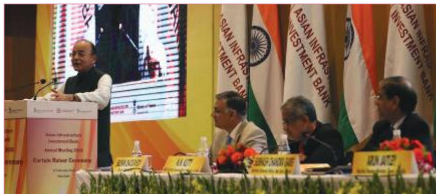
Shri Arun Jaitley, Hon'ble Finance Minister of India, delivering the Inaugural Address at Curtain Raiser Ceremony of AIIB Annual Meeting held at New Delhi.

In 2018, India is hosting the third Annual Meeting of the Asian Infrastructure Investment Bank (AIIB) in Mumbai on 22-27 June 2018. Given numerous opportunities and challenges in different sectors of infrastructure in India and other member countries of the AIIB, the Ministry of Finance, Government of India, has identified the RIS, New Delhi, as the Knowledge Partner to conceptualize, plan and organize a number of events on pertinent issues of infrastructure financing in the run up to the AIIB Annual Meeting. As a part of this series, RIS would organise the lead-up events in collaboration with industry associations such as the Confederation of Indian Industries (CII), Federation of Indian Chambers of Commerce and Industry (FICCI), the Associated Chambers of Commerce of India (ASSOCHAM) and the Export-Import Bank (EXIM Bank) of