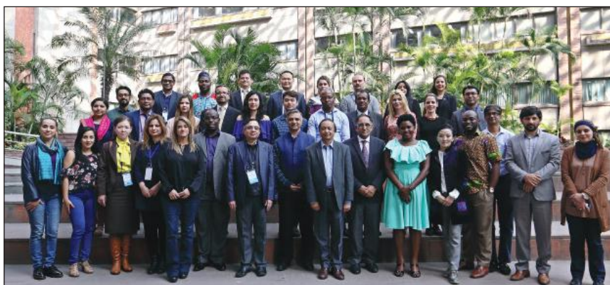
Participants of the ITEC Capacity Building Programme on Science Diplomacy with RIS faculty members.

The agenda of the programme included special lectures on Technology Assessment and Science, Technology Policy, A Conceptual Framework for Science Diplomacy, and Theoretical and Conceptual Framework of Science Diplomacy. This was followed by a Panel Discussion on India's Own Experiences across specific sectors- Such as Chandrayaan,