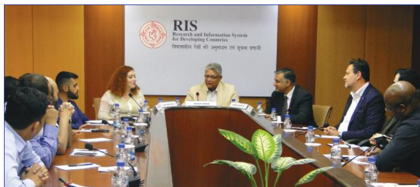
RIS-IBSA Fellows presenting their research findings.