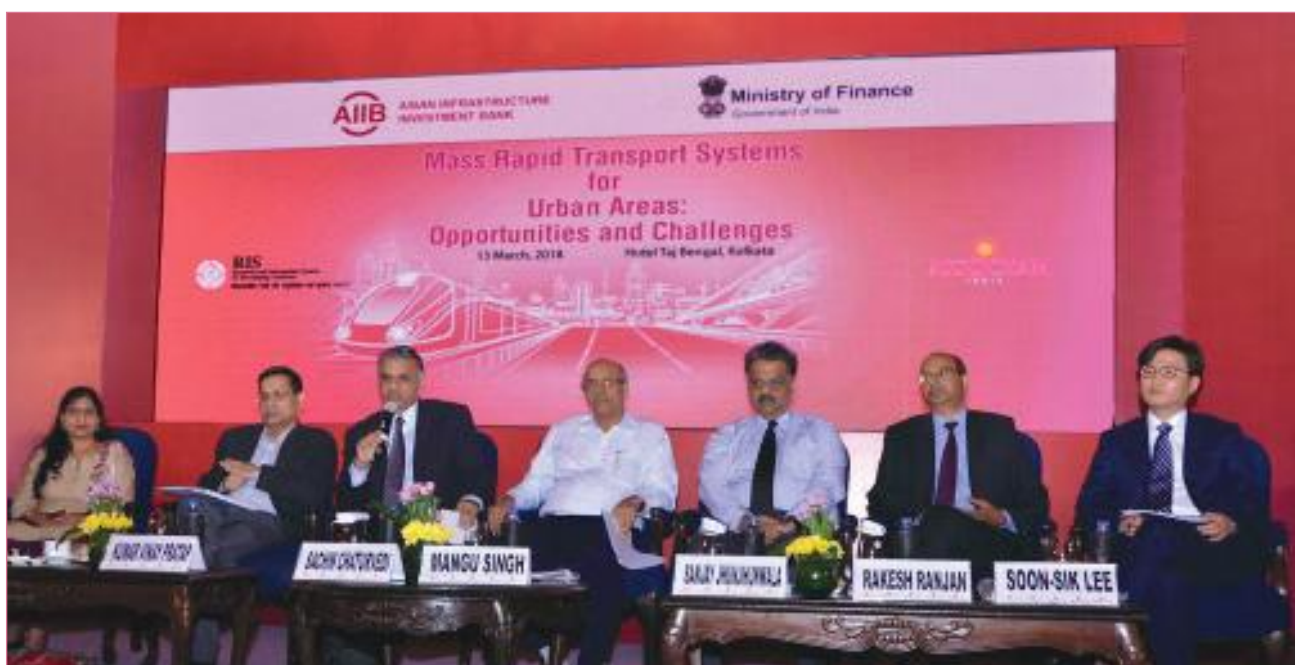
Distinguished participants at the inaugural session.

As reported, the Government of India would host the third Annual Meeting of the Asian Infrastructure Investment Bank (AIIB) at Mumbai in June 2018. In this regard, RIS is closely working with the Ministry of Finance as the Knowledge Partner for organizing thematic 'lead up events' on issues related to infrastructure financing in various parts of the country. After successful organization of the curtain raiser ceremony in New Delhi on 27 February 2018, a one day 'lead up event' was organized on the theme, Mass Rapid Transport Systems for Urban Areas: Opportunities and Challenges, at Kolkata on 13 March 2018 in association with ASSOCHAM, India.