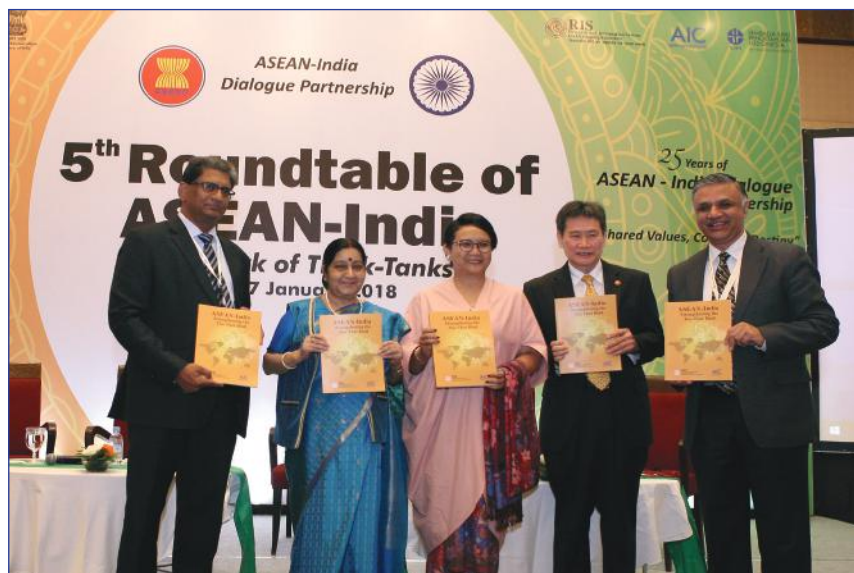
Release of AINTT Report by Hon’ble External Affairs Minister of India and Foreign Minister of Indonesia.