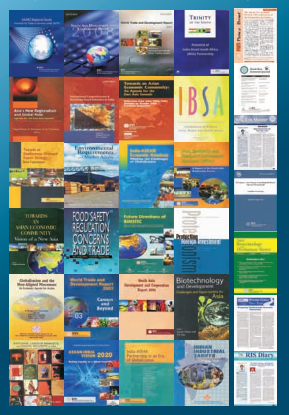
- Policy research to shape the international development agenda