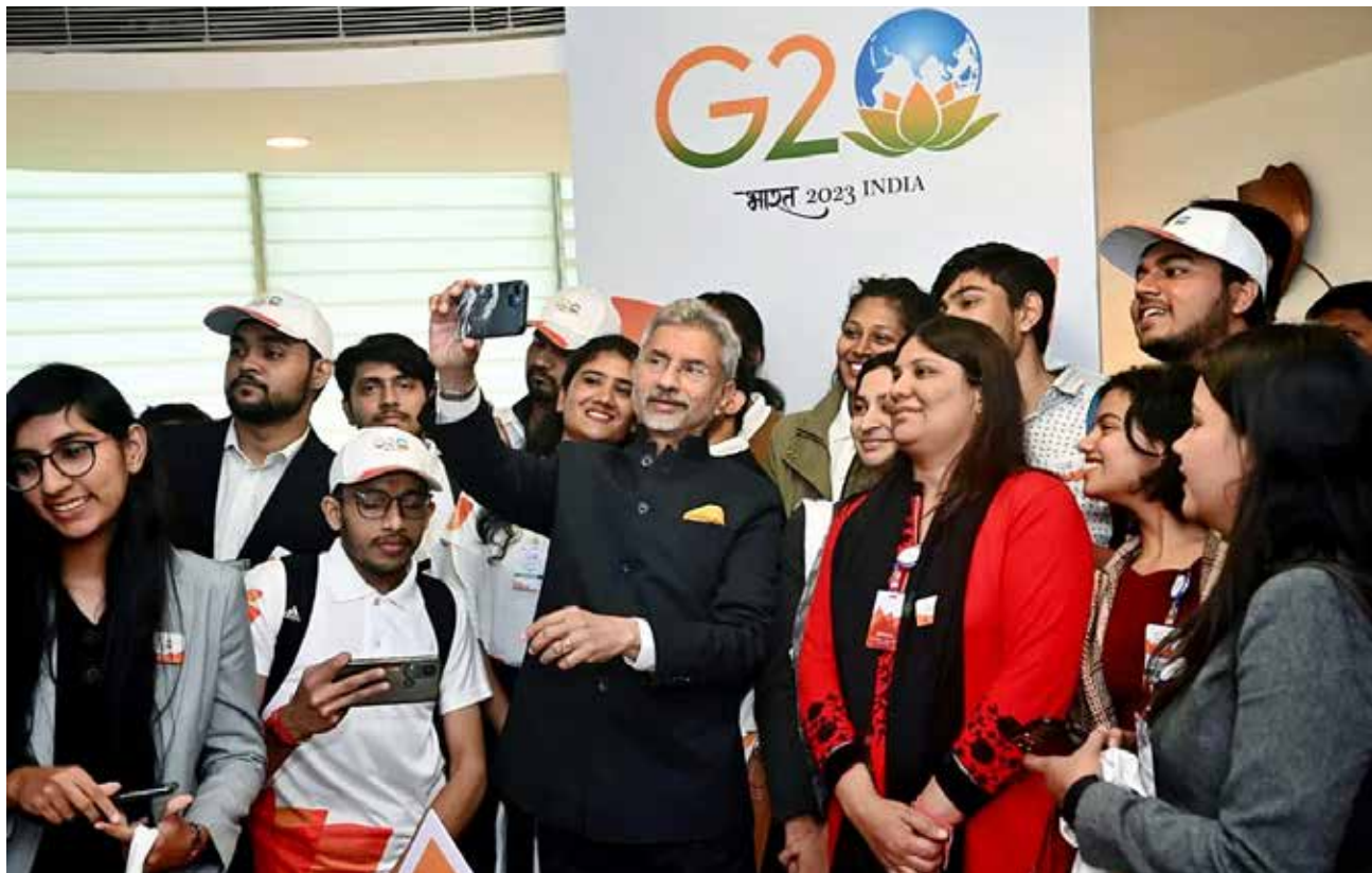
Hon'ble External Affairs Minister of India with students.

under the G20 university connect series by organising 75 lectures on G20 issues at 75 universities across different states and union territories of India.