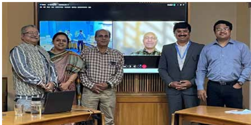
Distinguished participants at the Panel Discussion.