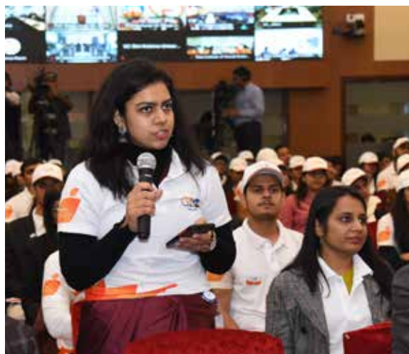
Interactive session with the students in progress.

External Affairs to spread awareness among the students and the youth