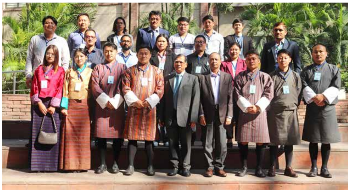
A delegation of Bhutanese Journalists and Editors.