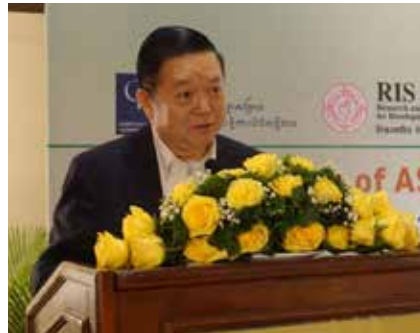
Special Address by H.E. Dr. Kao Kim Hourn, Minister Delegate Attached to the Prime Minister of the Kingdom of Cambodia and Secretary General (Designate), ASEAN

H.E. Dr. Kao Kim Hourn, Minister Delegate Attached to the Prime Minister of the Kingdom of Cambodia and Secretary General (Designate), ASEAN extended a dinner talk. Dr. Kao Kim Hourn reminded us that India-ASEAN strategic partnership was