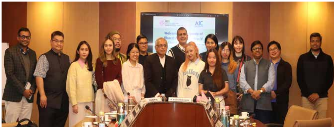
Delegation from the Chulalongkorn University at RIS.

A delegation of Thai scholars from the Chulalongkorn University visited the RIS on 21 December 2022 under the annual flagship study tour "Bharata Shiksha Yatra". In this visit, they wanted to get