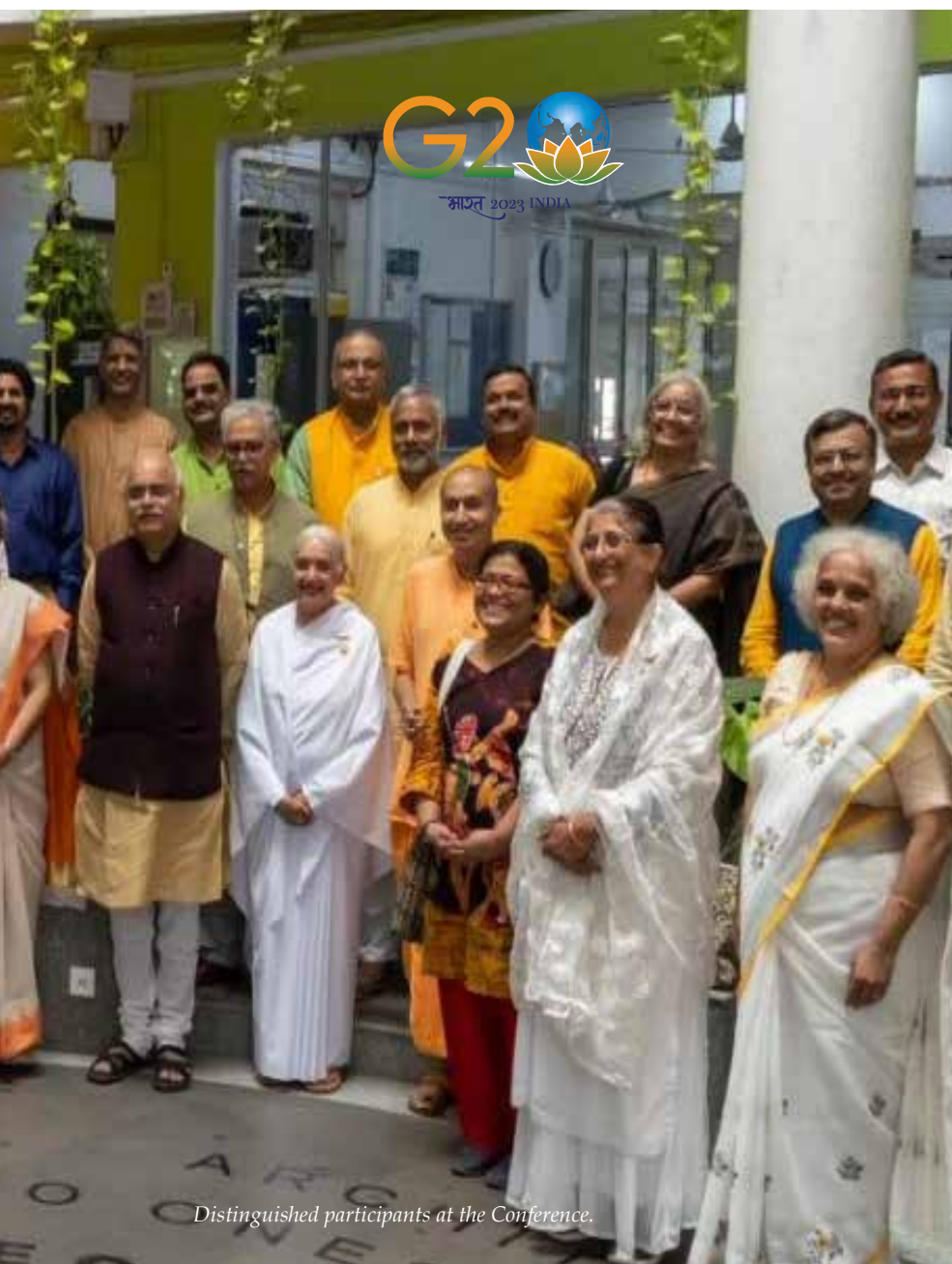
Distinguished participants at the Conference.

Therein, what should be the role of CSOs in developmental paradigm and going beyond continuous deliberations, research and discussions; and institutional arrangements that may be needed for this purpose? Finally, how can Indian CSO's help in devising indigenous solutions for problems in developing world, starting from identifying problems, understanding local experiences and