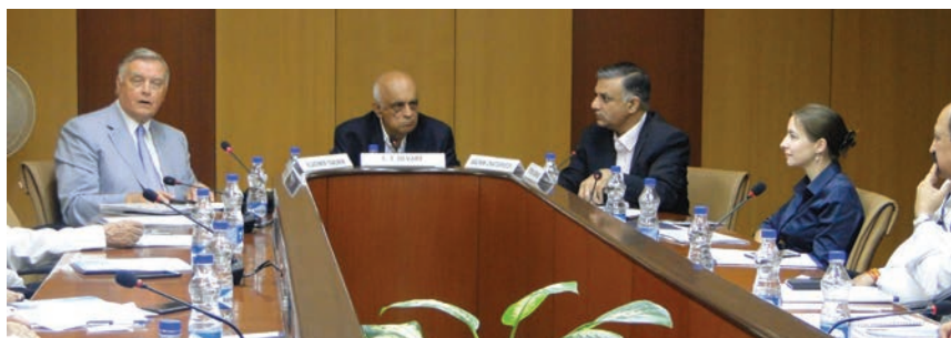
Participants at the discussion meeting on India-Russia Bilateral Relations.