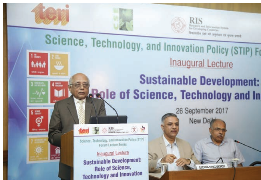
Dr. R. Chidambaram, Principal Scientific Adviser to Government of India, delivered the lecture.

The Forum has been founded with the objectives of promoting