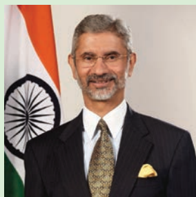
Dr. S. Jaishankar Foreign Secretary

The Vision Document of the Asia-Africa Growth Corridor (AAGC) that was released at the African Development Bank meeting in May this year envisages it as “A people-centric sustainable growth strategy details of which would be evolved through a process of detailed consultations engaging various stakeholders.” I underline this message because growth and connectivity initiatives are truly globally owned only when they emerge from a broad consultative process. It is particularly necessary if you are to ensure that such initiatives are demand driven and locally owned.