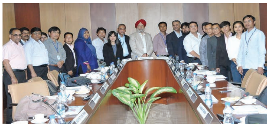
RIS Faculty with ASEAN Journalists.