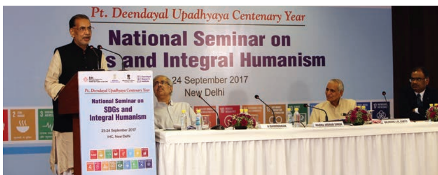
Shri Radha Mohan Singh, Hon'ble Minister of Agriculture and Farmers Welfare, Government of India speaking at the seminar