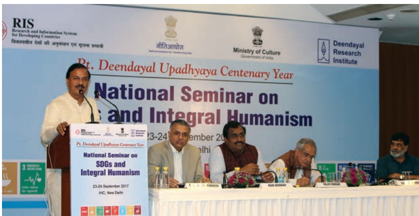
Dr. Mahesh Sharma, Hon'ble Minister of State (Independent Charge), Ministry of Culture and Minister of State in the Ministry of Environment, Forest and Climate Change, Government of India speaking at the seminar.