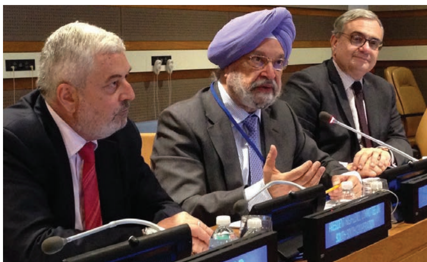
The workshop on Impact Assessment for South-South Cooperation in progress.