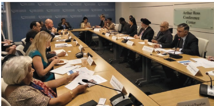
Participants at Panel Discussion on Implementing Agenda 2030.

The interactions also touched on enhancing provision of global public goods to meet SDGs, besides localization of SDGs. Following were the topics-- (1) institutional frameworks and the rise of emerging developing countries, (2) localization