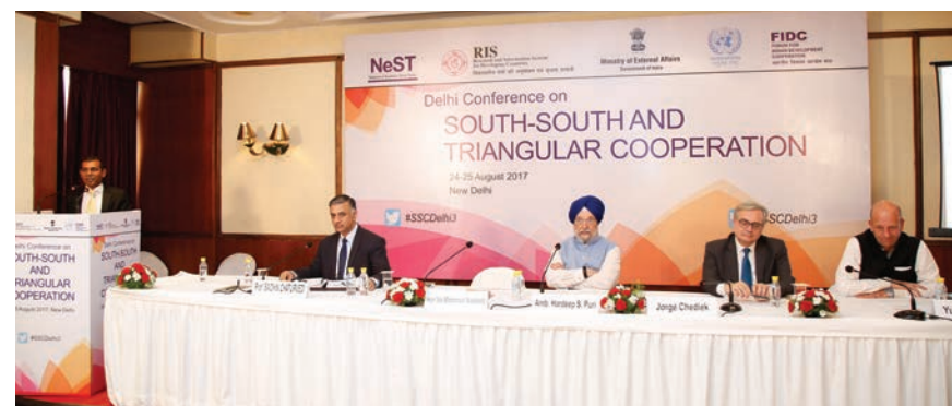
Hon'ble Mr Mohamed Nasheed, former President, Republic of Maldives, delivering the valedictory address.