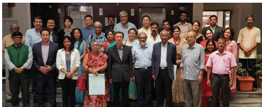
Participants of the Joint International Workshop on India-Myanmar-Thailand Trilateral Relations.

The objectives of the workshop were to (i) identify the challenges that