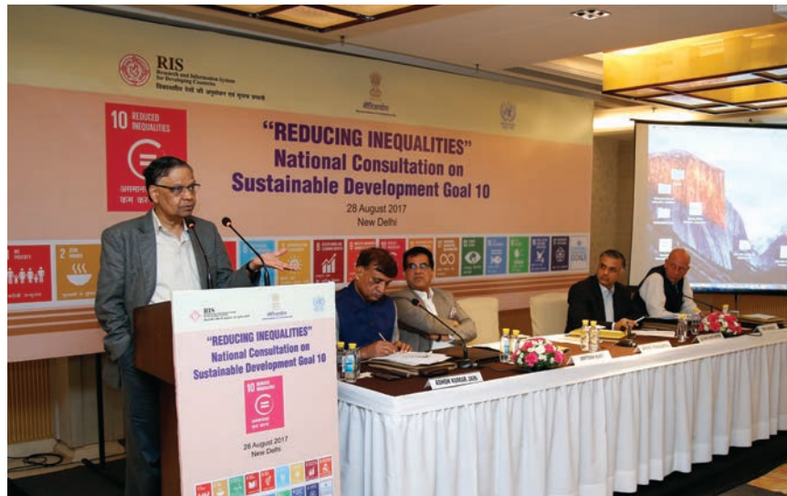
Dr. Arvind Panagariya, Vice Chairman, NITI Aayog, delivering the keynote address