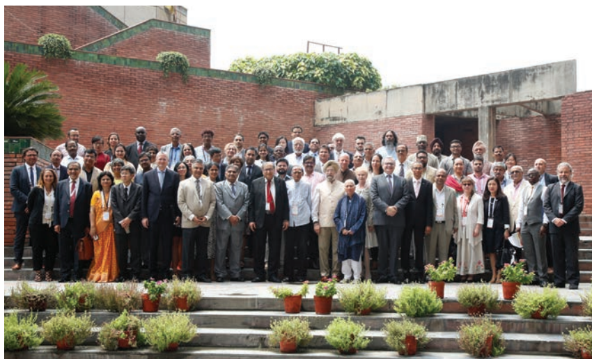
Participants of the Delhi Conference on South-South and Triangular Cooperation.

address. The detailed agenda of the Conference is available at the RIS website: www.ris.org.in