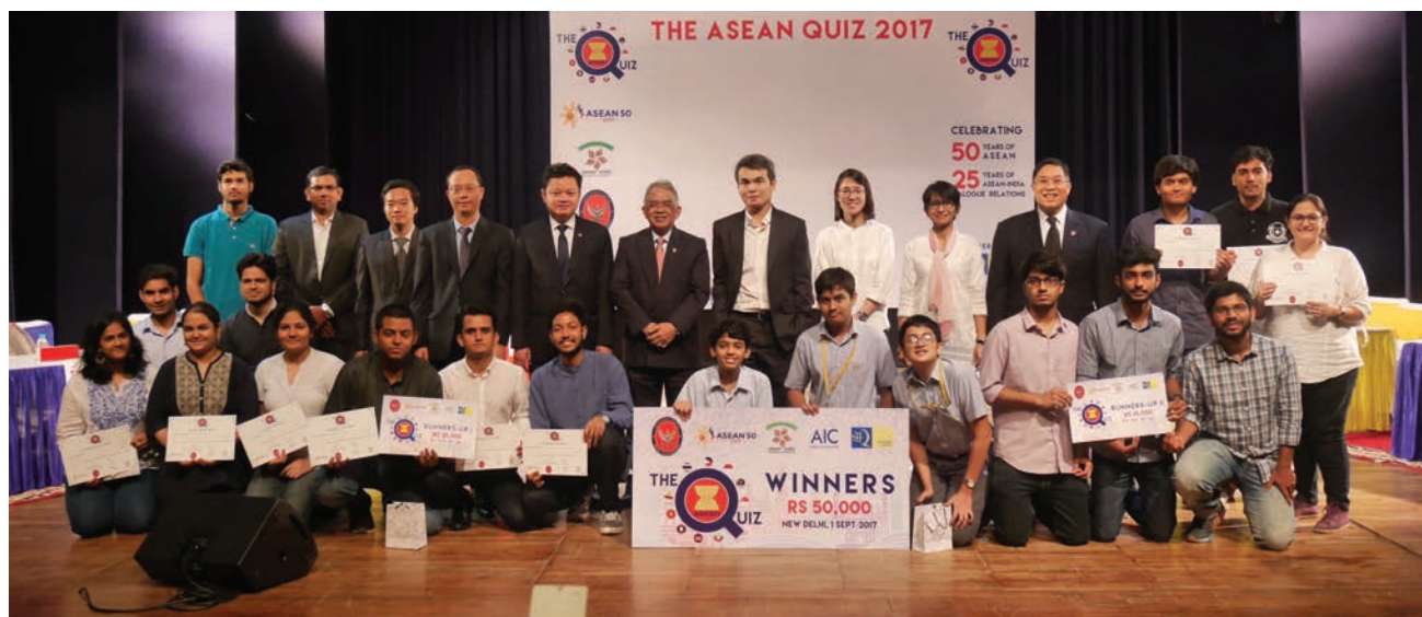
ASEAN Delegates and Grand Finale Contestants.

The Royal Thai Embassy, in collaboration with the ASEAN New Delhi Committee and the ASEAN-India Centre at RIS, organized 'The ASEAN Quiz' on 1st September 2017 at Arya Auditorium, New Delhi. The event marked the celebration of the 50th anniversary of the establishment of ASEAN and the 25th anniversary of ASEAN-India Dialogue Relations and aimed to spread awareness of ASEAN and its achievements among the Indian public especially