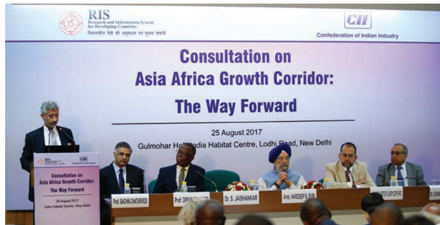
Foreign Secretary Dr. S. Jaishankar addressing the participants.