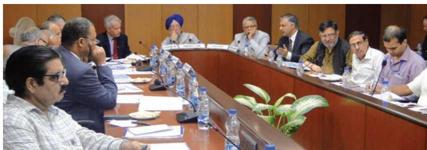
Participants at the interactive session of AAGC.