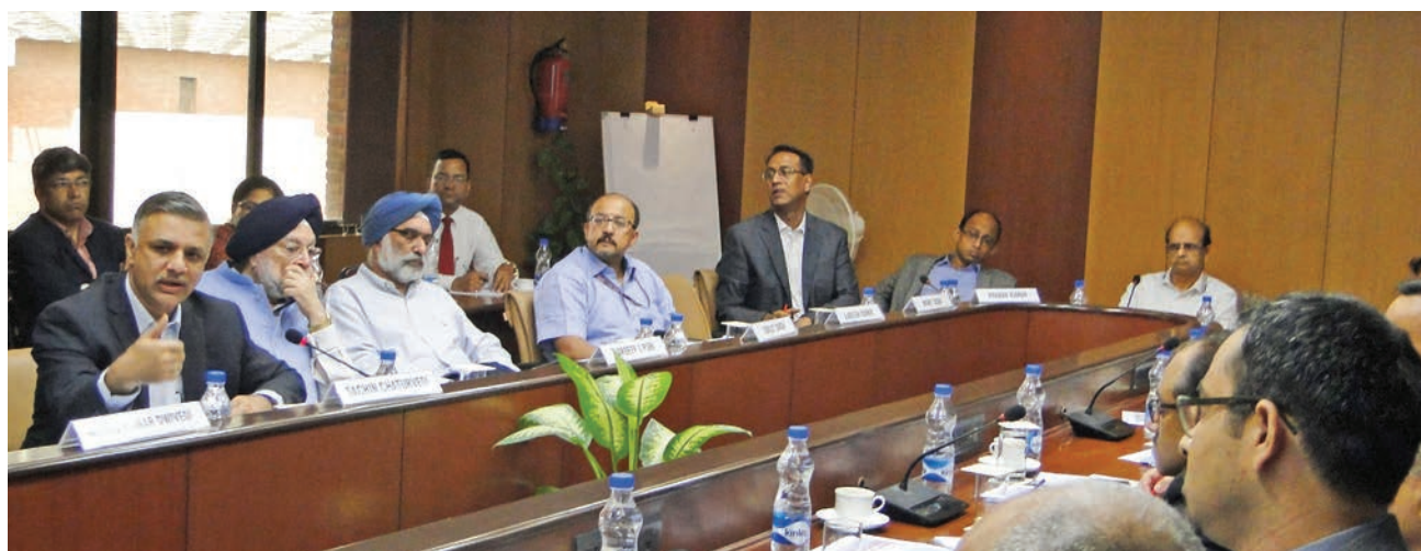
Participants at AAGC consultation meeting that was held at RIS.