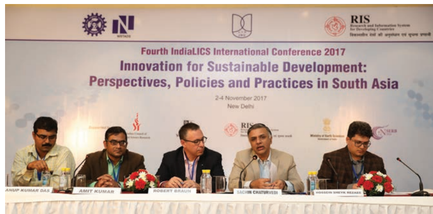
Participants at a session of the conference.

This Conference explored nature, determinants and direction of innovations and new way outs for meeting future challenges for sustainable development in terms of South Asian perspectives. The conference deliberations were basically on challenges and opportunities in fostering