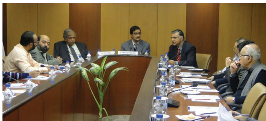
Participants at the lecture programme.

The lecture touched various pertinent issues regarding solar energy production and trade, and debate concentrated on specific