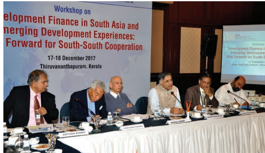
Participants at the workshop on Development Finance in South Asia and Emerging Development Experiences: Way Forward for South-South Cooperation.