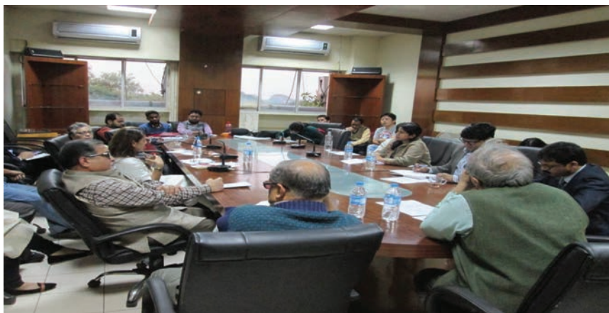
Participants at the Kolkata Round table on ASEAN@50 and ASEAN-India@25