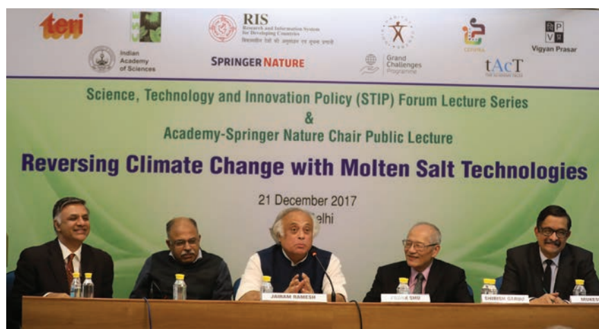
Dr Jairam Ramesh, Member of Parliament (Rajya Sabha) (third from left) speaking at the lecture programme.