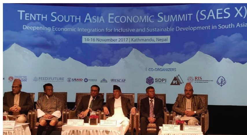
The Tenth South Asia Economic Summit in progress.

The Tenth South Asia Economic Summit (SAES X) was held in Kathmandu from 14 to 16 November 2017, under the central theme of