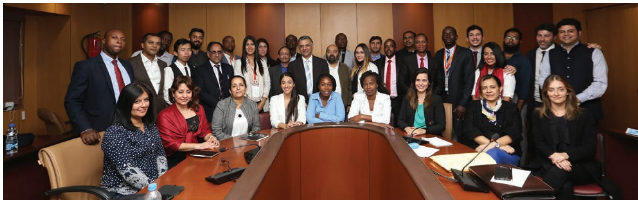
Participants of the ITEC programme on Learning South-South Cooperation with RIS faculty members.

A capacity-building programme on Learning South-South Cooperation was conducted under the ITEC / SCAAP Programme of the Ministry of External Affairs, Government of India, from 13 to 24 November 2017 at RIS, New Delhi, in which more than 29 participants from 22 different southern countries took part. This programme exposed incumbent to some important examples in the Development Cooperation besides covering modules on Development Cooperation; Theoretical Backgrounders; Development Compact: The Modalities; Different Actors in SSC; India's Role in SSC: A Sectoral Perspective and