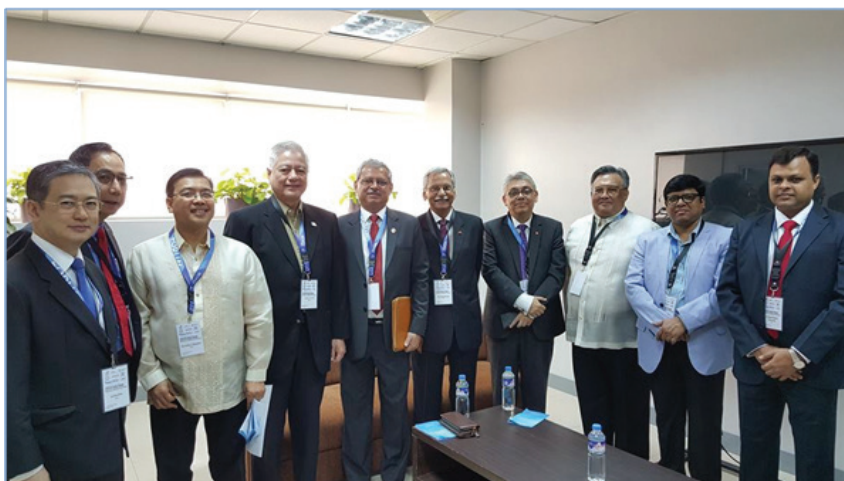
Participants at the first ASEAN-India Forum.