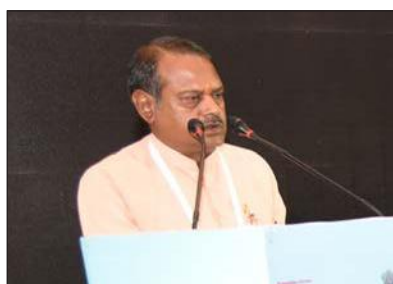
Mr Narayan Singh Kushwaha, Hon'ble Minister of New & Renewable Energy, Govt. of Madhya Pradesh addressing at the lead-up event on Clean and Renewable Energy held at Bhopal on 21 May 2018.

The Report entitled 'New Quest for Mobilising Financing for Infrastructure' was launched by Shri Piyush Goyal, Hon'ble Minister of Finance at Mumbai on 25 June 2018 during the third Annual Meeting of the AIIB. Shri Devendra Fadnavis, Hon'ble Chief Minister of Maharashtra ; Shri