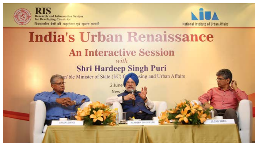
Shri Hardeep Singh Puri, Hon'ble Minister of State (Independent Charge), Ministry of Housing and Urban Affairs, Government of India delivering the keynote address.