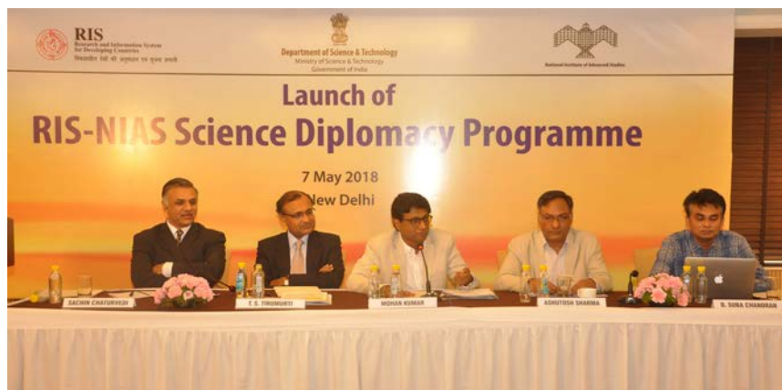
Inaugural Session of the Launching Science Diplomacy Programme.