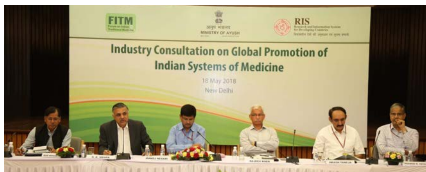
Inaugural session of the consultation in progress.

The Consultation had four major Panel Discussions identifying challenges and solutions for global promotion of Indian systems of medicine. These included a review of domestic policy and regulatory preparedness on export promotion; measures for international manufacturing standards and quality assurance through greater scientific validation and subscription to pharmacopoeial standards ; challenges associated with supply of raw materials including collection and cultivation of medicinal plants ; and regulations on wellness industry for quality control of practitioners in India and abroad and impact of bilateral and