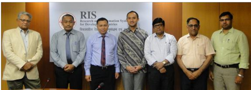
Indonesian Delegation at RIS.