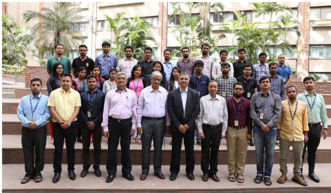
Participants of the RIS-EXIM Bank Summer School on International Trade Theory and Practices with RIS faculty.