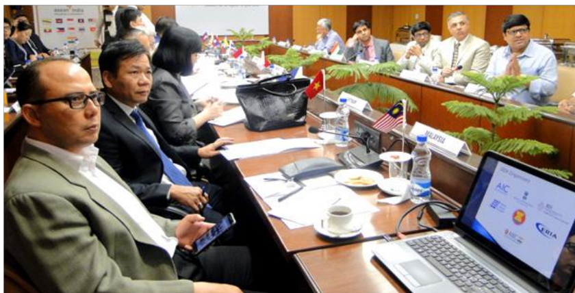
Participants at the consultation meeting on Delhi Dialogue X with ASEAN HoMs.