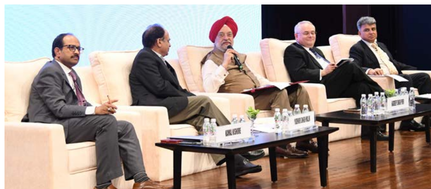
Shri Hardeep Singh Puri, Hon'ble Minister of State (Independent Charge), Ministry of Housing and Urban Affairs, Government of India speaking at the AIIB host country seminar on Building Resilient and Quality Infrastructure.

All lead-up events fructified in holding of Host Country Seminars on the following areas – Infrastructure Financing: Exploring Innovative Ways and Partnerships on 24 June 2018; Forging Collaboration and Partnerships: Evolving