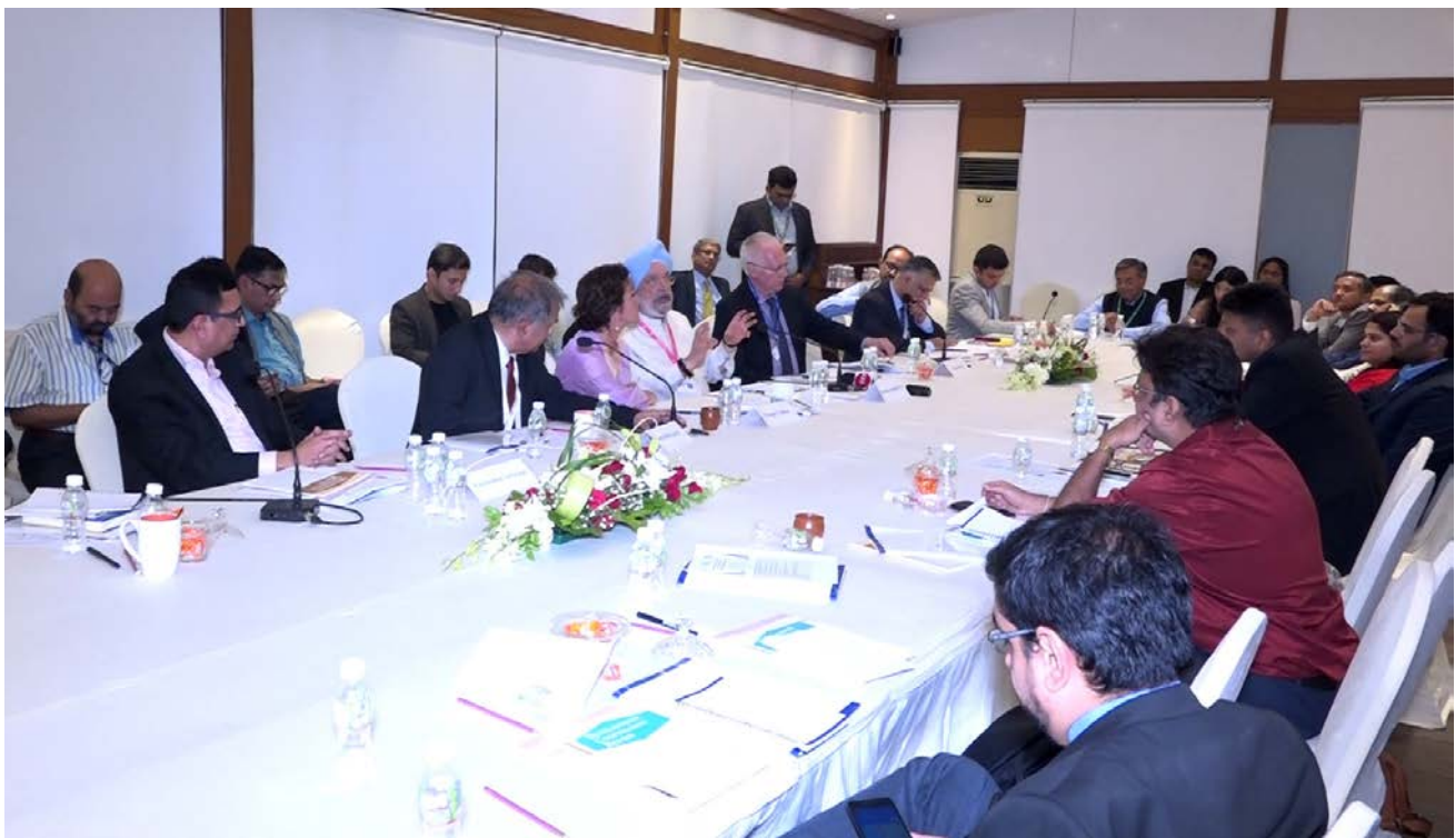
Shri Hardeep Singh Puri, Hon'ble Minister of State (Independent Charge), Ministry of Housing and Urban Affairs, Government of India addressing the participants.