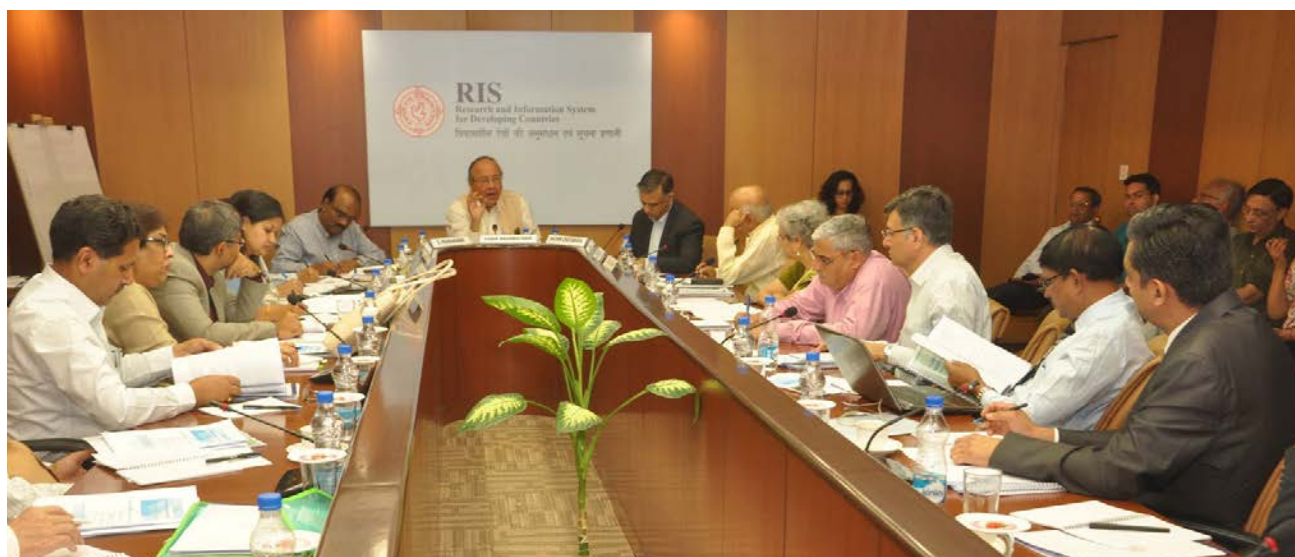
Participants on Stakeholder Consultation on Draft New Clinical Trial Rules, 2018.