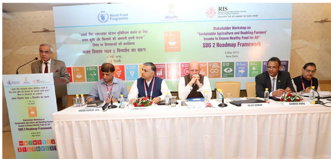
Dr Rajiv Kumar, Vice-Chairman, NITI Aayog, Government of India, delivering the keynote address.