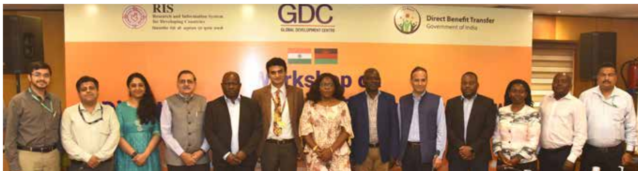
Distinguished participants at the workshop on DBT system.