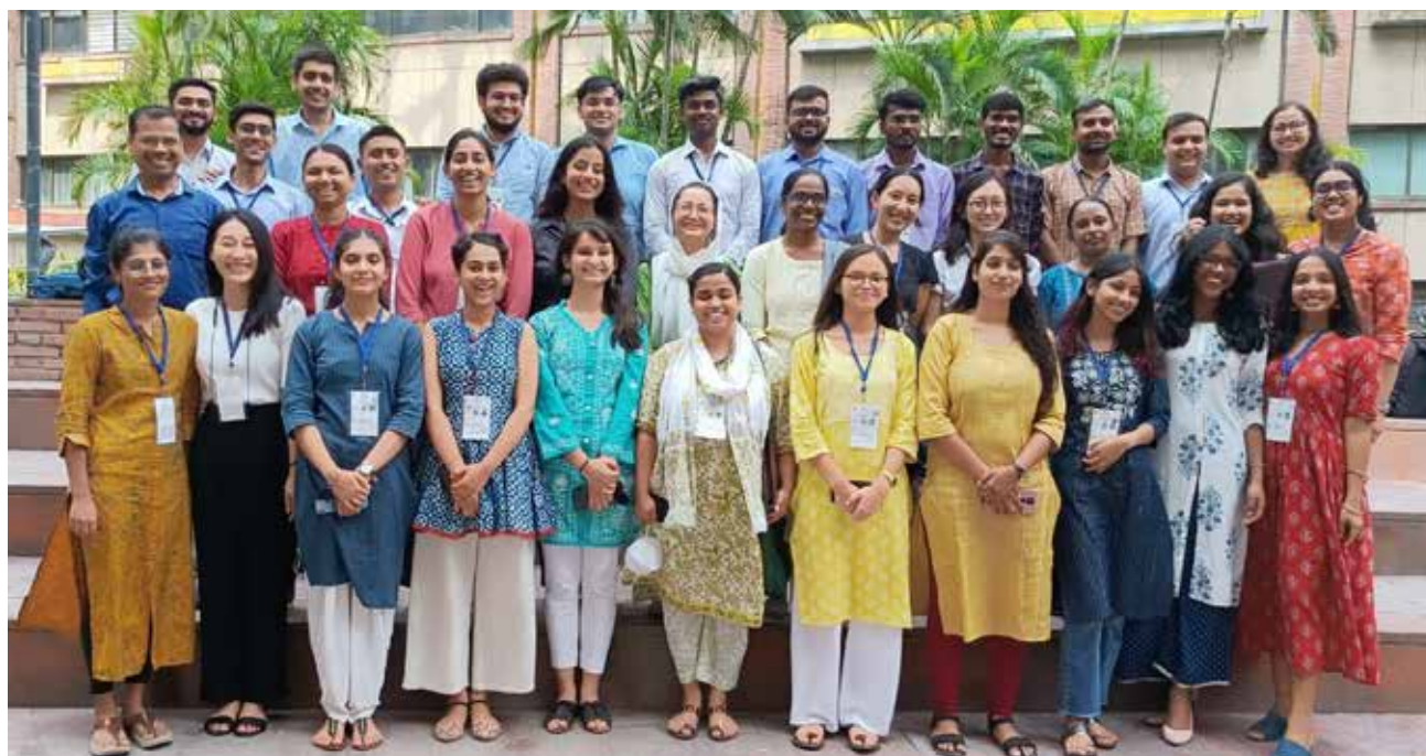
Group of MEA Interns at RIS.