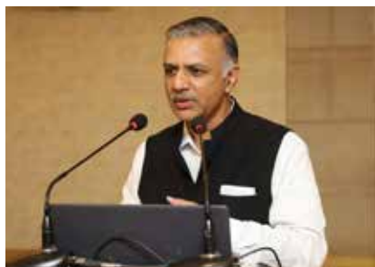
Professor Sachin Chaturvedi

As part of its capacity building programme, RIS, in collaboration with Sushma Swaraj Institute of Foreign Service (SSIFS), New Delhi, conducted a three-day Induction Training Programme (ITP) for the IFS Officer Trainees and two Bhutanese diplomats during July 05-07, 2022 at RIS. The training module covered the contemporary challenges faced by the Indian economy in the context of bilateral, regional and