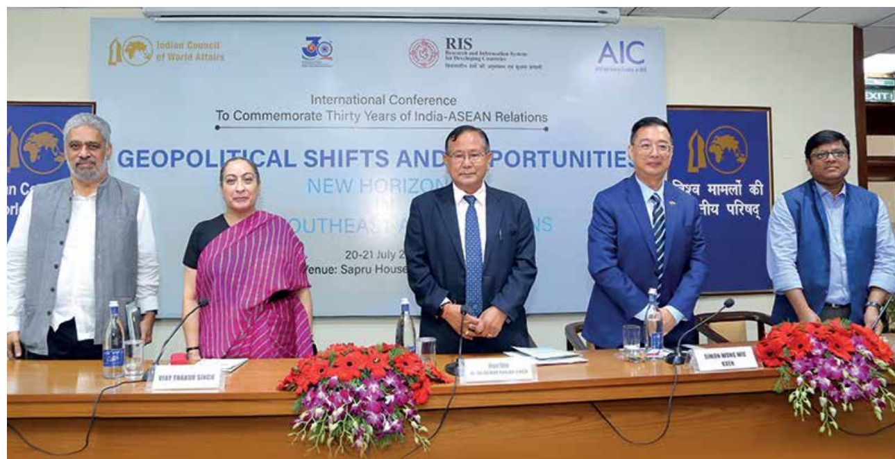
Hon'ble Minister of State for External Affairs, Government of India, Dr Rajkumar Ranjan Singh with other dignitaries at the International Conference.

The Indian Council of World Affairs (ICWA) in collaboration with ASEAN India Centre (AIC) at Research and Information System for Developing Countries (RIS) organized a two-day International Conference to commemorate thirty years of India-ASEAN relations on the theme "Geopolitical Shifts and Opportunities: New Horizons in India-Southeast Asia Relations" on 20-21 July 2022. The seminar had more than forty speakers from think tanks, academic institutions as well