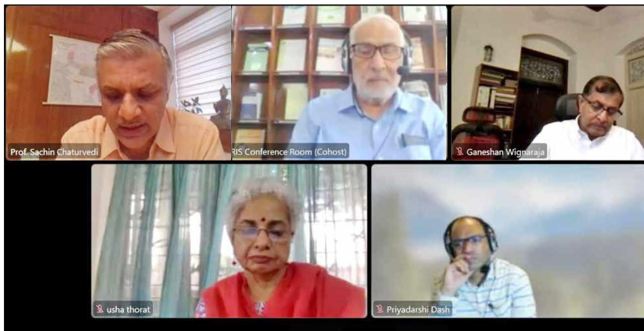
Panel discussion in progress.

The South Asian countries witnessed different recovery trajectories in the post-Covid period. Risks emanating from the evolving global economic scenario, high debt level, rising prices and associated macro-economic challenges remained elevated for the regional economies for quite some time. Sri Lanka, in particular, has faced the worst economic crisis in recent years. Fall in export revenues, unsustainable public debt and low foreign exchange reserves amidst political instability worsened the economic crisis in the country.