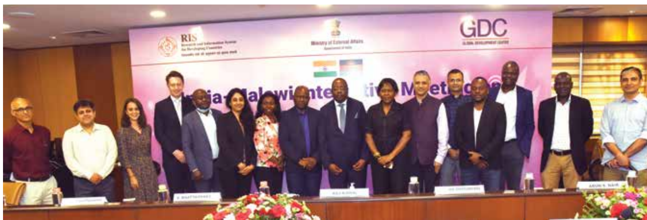
Participants at the India-Malawi Interactive session.

Global Development Centre (GDC) at RIS organised an India-Malawi interactive session on digital payment solutions on September 28, 2022 at RIS. The purpose of the meeting was to brainstorm and ideate strategies which can be of help for Malawi in adopting digital payment systems.