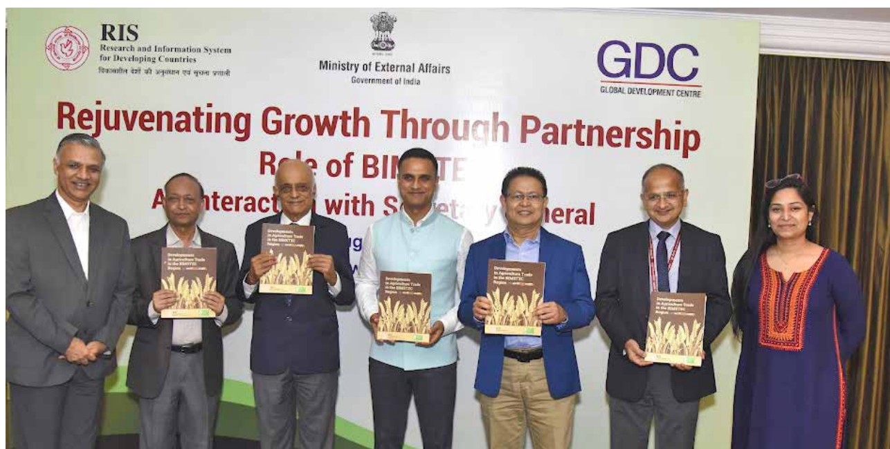
Distinguished dignitaries at the launch of the RIS-IFPRI Report on Developments in Agriculture Trade in the BIMSTEC Region.

(Full Report is available on RIS website www.ris.org.in ). ■