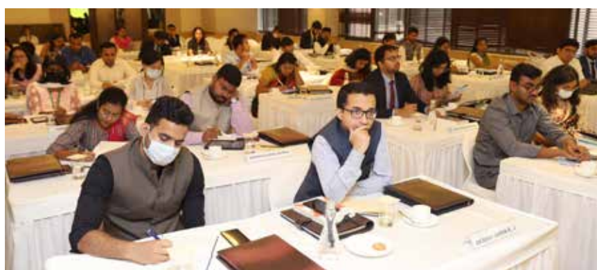
IFS Officer Trainees attending the Capacity Building Programme at the RIS.