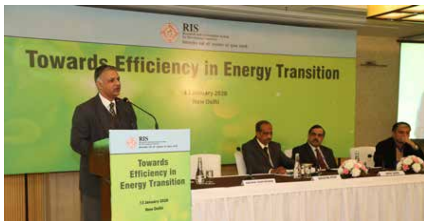
The session of the Special Talk in progress.