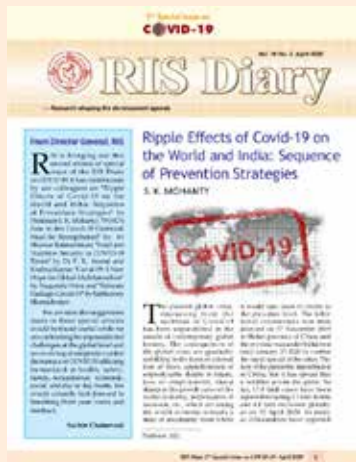
Volume: 16 April, 2020