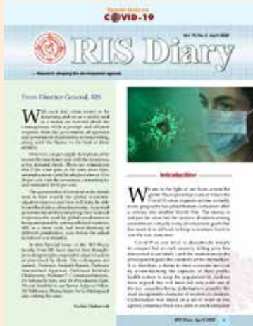
Volume: 16 March, 2020