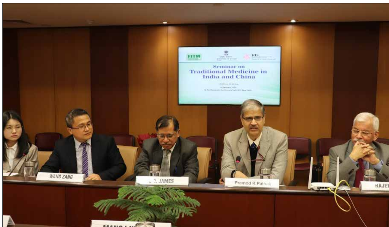
Seminar on "Traditional Medicine in India and China" on 16 January 2020 in progress.