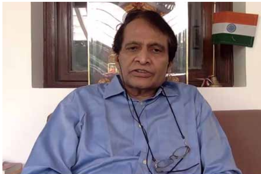
Hon'ble Shri Suresh Prabhu, G20 Sherpa of India.

Besides official tracks, Engagement Groups such as Think Tank 20 (T20), Women 20 (W20), Business 20 (B20), Civil 20 (C20), Science 20 (S20), etc. play crucial role in articulating ideas and solutions for the Leaders' Summits. With an aim to promote collective understanding of the unique space and strength of each engagement groups and build a synergistic narrative on common areas, RIS organised a Webinar on "Priorities for India's G20 Presidency in 2022: Role of Engagement Groups" on 11 May 2020. The programme began with initial remarks by