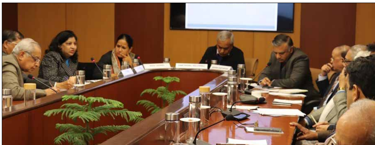
A Breakfast seminar on 'Medical Devices Sector in India: Regulations, Local Manufacturing and Trade' in progress.