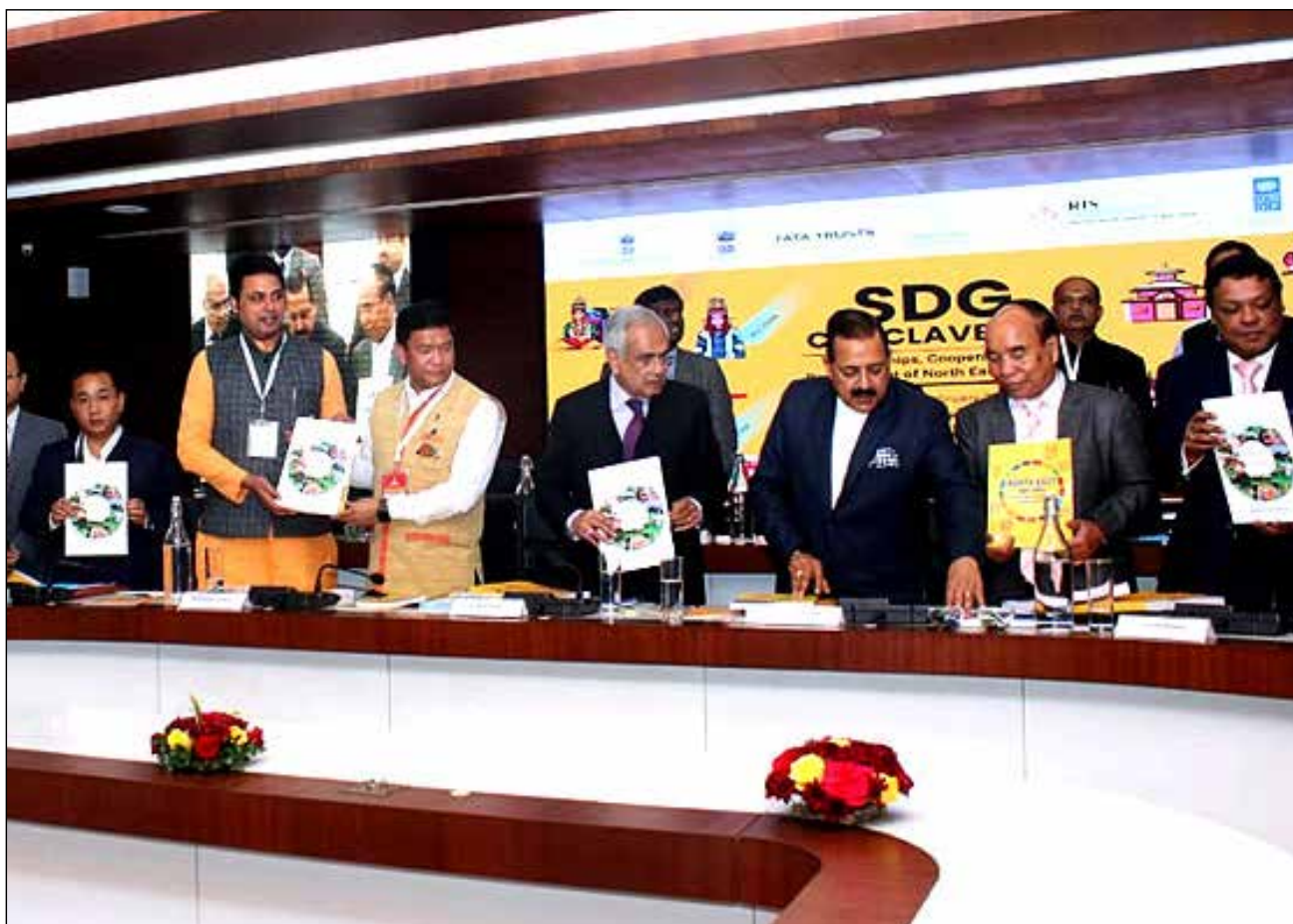
The North East SDG Conclave organised on 24-26 February 2020 in Guwahati, Assam with participation of senior ministers from the Central Government and Chief Ministers of North Eastern States.