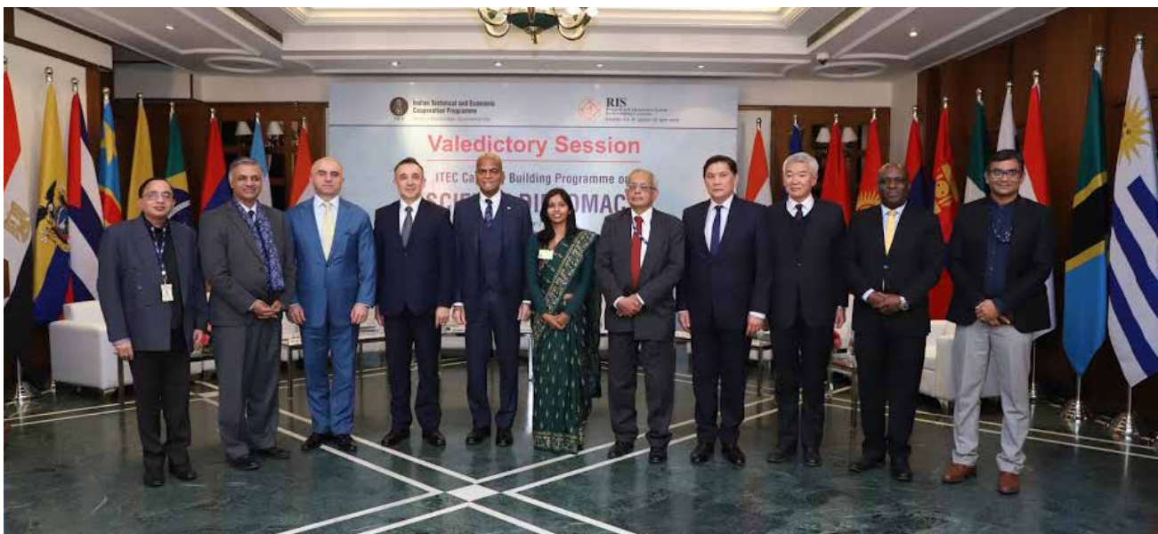
Participants at the Valedictory session of the Science Diplomacy Programme.

in Science Diplomacy; Emerging Technologies such as Gene-Editing and AI; Cyber Security; ICT and Law Enforcement; Digital Economy; Technology Transfer and Trade; and SDGs and South-South Cooperation. In addition to the lectures and group discussions, the participants visited to the International Solar Alliance and ICGEB.