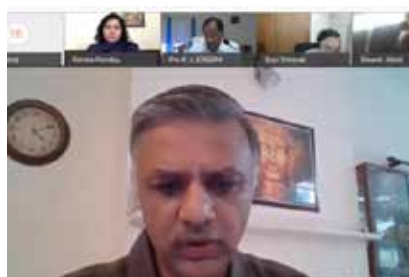
Webinar in progress