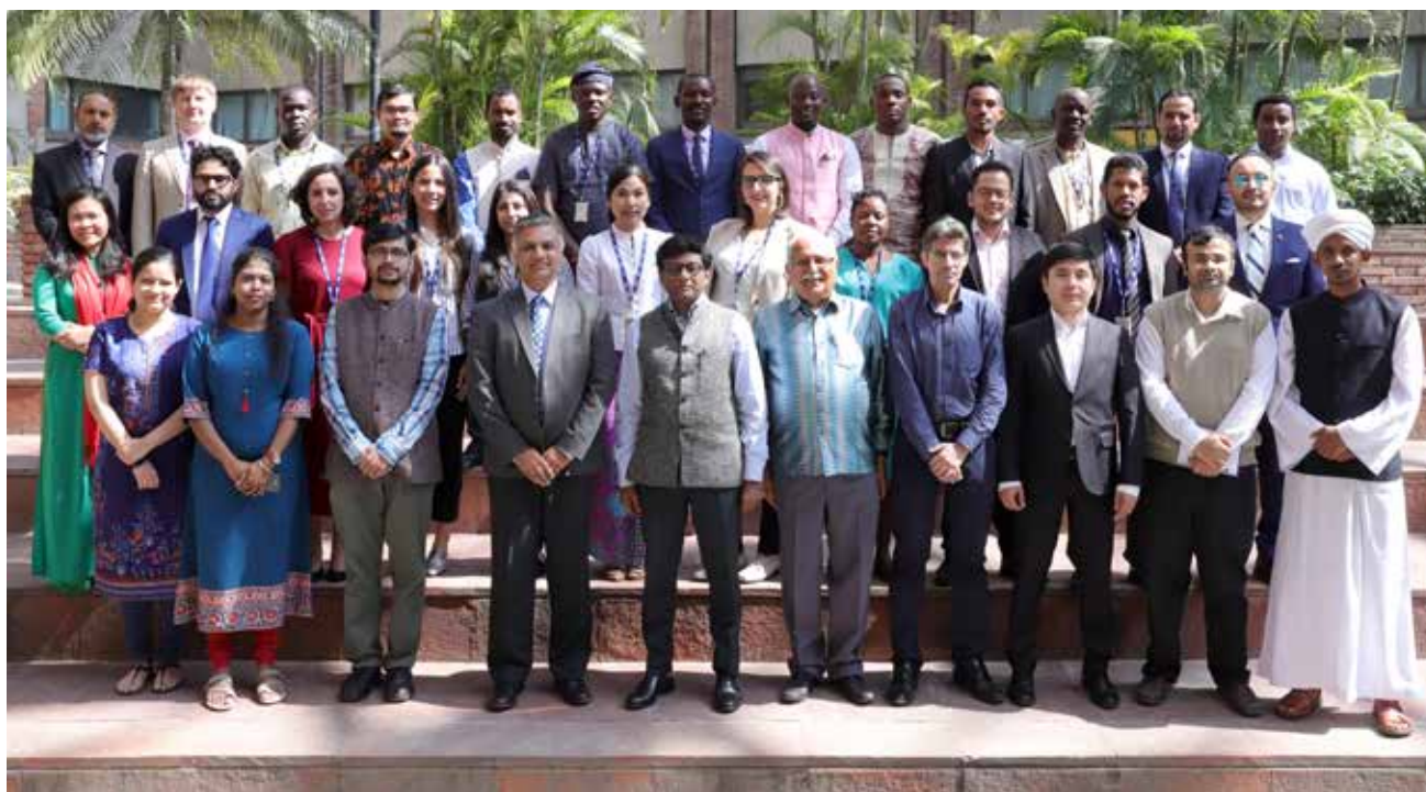
Participants of the RIS-ITEC Capacity Building Programme on International Economic Issues and Development Policy with the RIS Faculty.

participated in the programme. The report 'Global Governance and Economic Cooperation: Opportunities and Challenges for Developing Countries' was also brought out at the end of the programme.