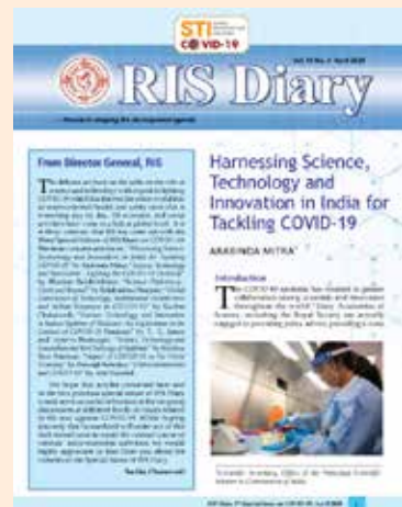
Volume: 16 April, 2020