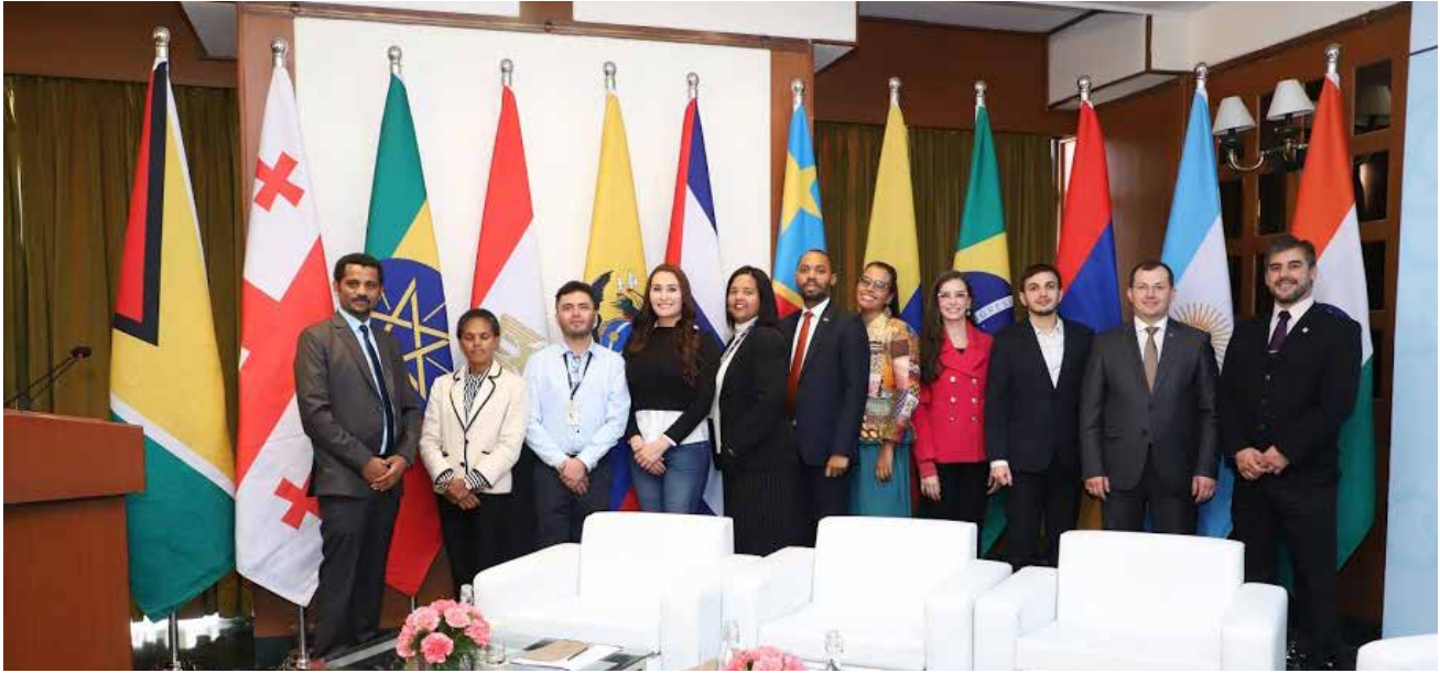
Participants of the RIS-ITEC Capacity Building Programme on Science Diplomacy.