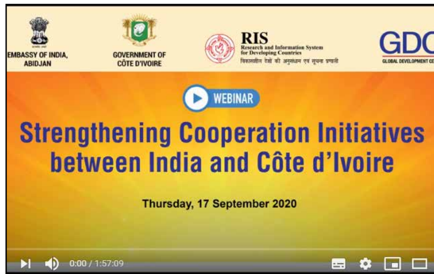
Webinar in progress