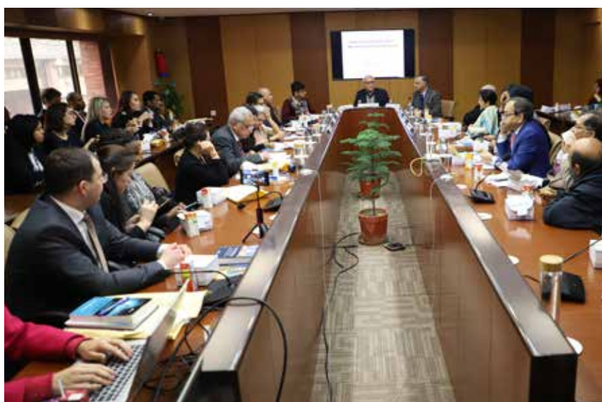
Roundtable on 'Social Enterprises and Social Stock Exchange' in progress at RIS.