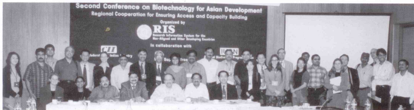
Participants of the Second Conference on Biotechnology for Asian Development: Regional Cooperation for Ensuring Access and Capacity Building, on April 7-8, 2004 in New Delhi.

The support from UNESCO and Department of Biotechnology, Government of India was appreciated by the board.