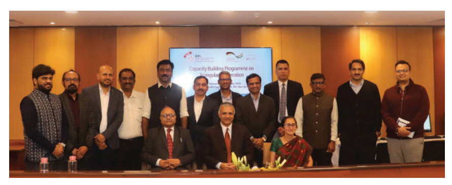
Participants at the Capacity Building Programme.

It was attended by 11 participants from 9 diverse institutions, encompassing academia, development cooperation practitioners, civil society, and other stakeholders. The programme was designed to orient the participants towards an integrated and multidimensional understanding of Triangular cooperation and covered