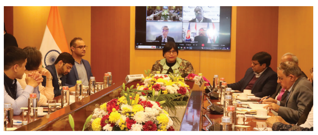
Distinguished speakers at the seminar.

The International Seminar on "20th ASEAN-India Summit: From Outcomes to Implementation" was held on 8 February 2024 at RIS. Delegates, policymakers and subject experts to deliberate on a wide range of crucial topics for ASEAN-India partnership.