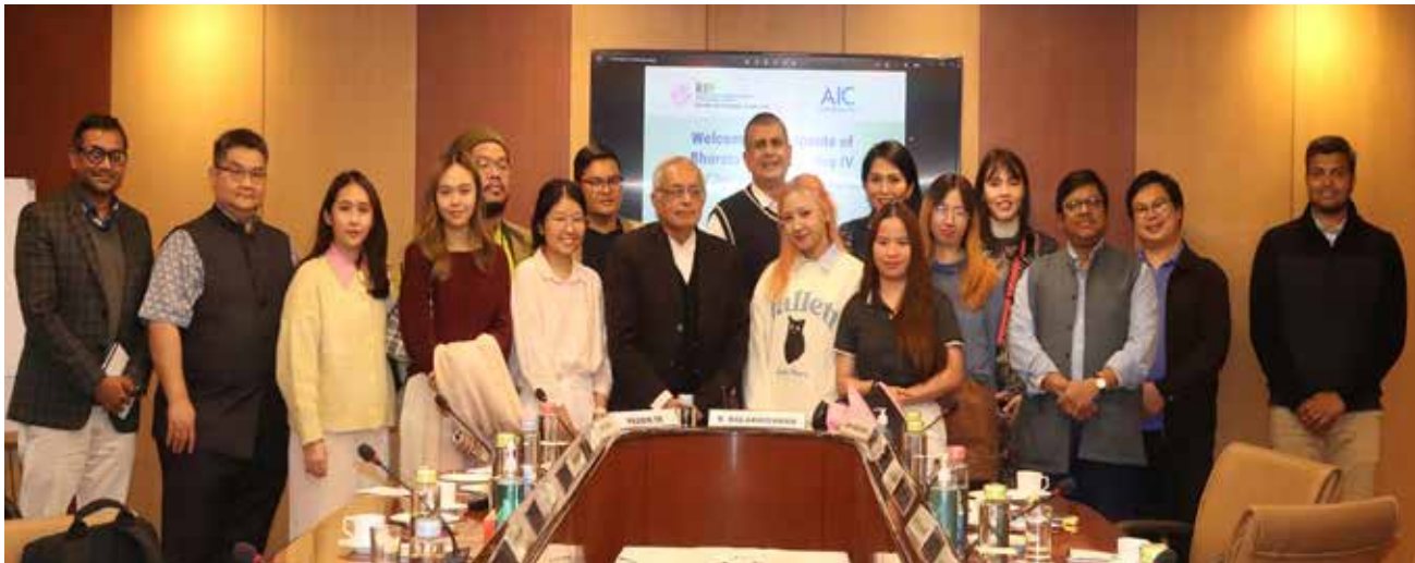
Delegation from the Chulalongkorn University at RIS.

A delegation of Thai scholars from the Chulalongkorn University visited the RIS on 21 December 2022 under the annual flagship study tour "Bharata Shiksha Yatra". In this visit, they wanted to get enriched on