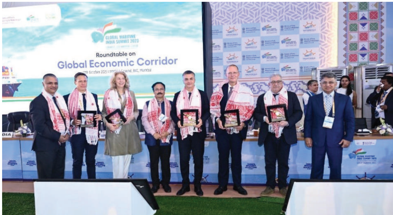
Distinguished Dignitaries at GMIS.