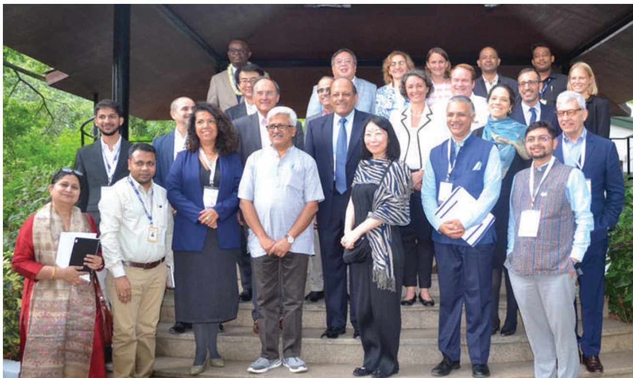
Participants at T20 Summit Joint Session.