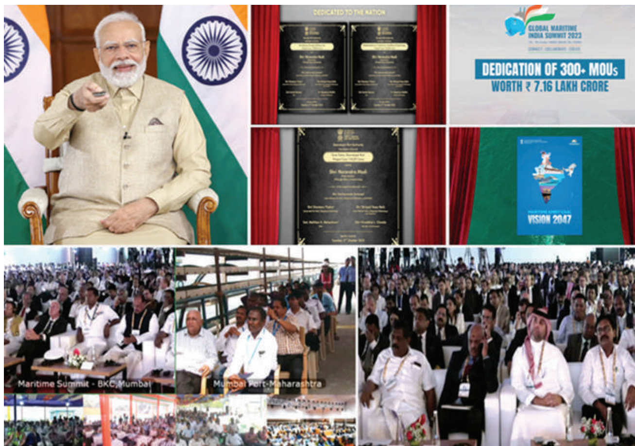
Participants at the Global Maritime India Summit 2023.

The Centre for Maritime Economy and Connectivity (CMEC) at RIS was the knowledge partner at the mega Global Maritime India Summit, (GMIS) 2023 inaugurated by Hon'ble Prime Minister Shri Narendra Modi. The programme was organized from 17-19 October 2023 at MMRDA Ground, Mumbai.